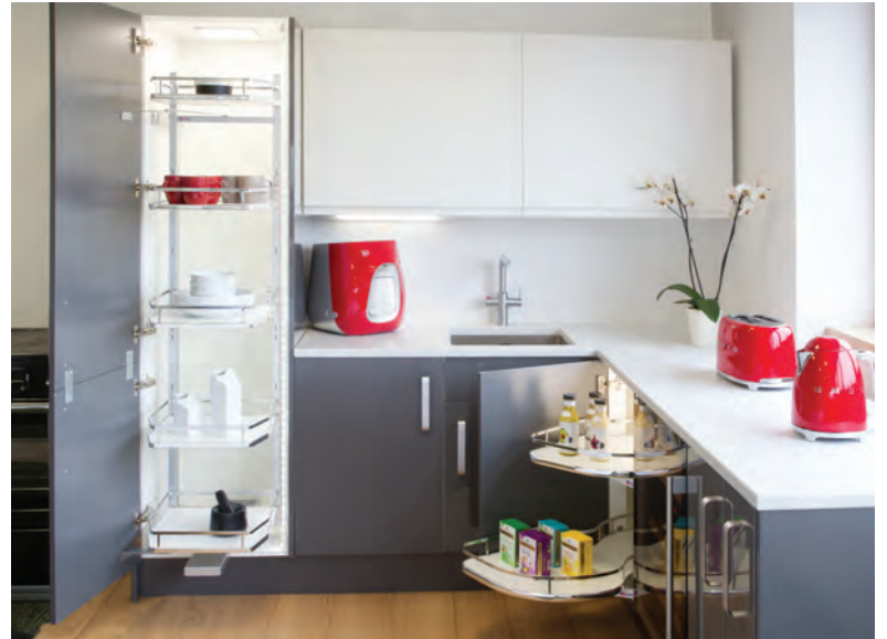
Co-ordinating Häfele larder unit and Nuvola corner unit shown on pages 13 and 20

Single pull out storage basket set or two-tier pull out unit, both side mounted with full extension runners included.